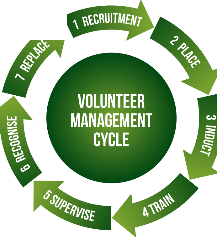
Figure 1 Volunteer Management Cycle

The Volunteer Management Cycle (Figure 1) outlines the on-going process Clubs need to implement; bringing volunteers into the Club, looking after them while they fulfil their duties and then planning for when they leave.